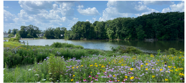
Join us for a hike at Brunswick Lake on August 14 at 10 a.m.

6734 State Rd. Sharon Township (use Wadsworth, OH 44281 for GPS)