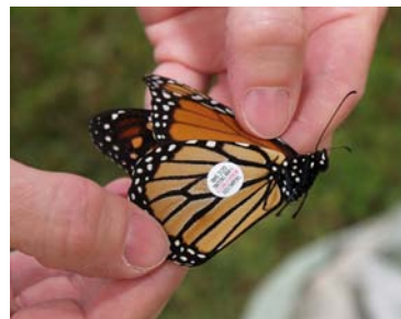
Butterfly tagging is one of many activities at the Monarch Madness event.

If you would like to learn more about the extraordinary life of the Monarch butterfly and see some great examples of butterfly habitat, then plan to attend the Monarch Madness event on September 11. This free event is from 12-4 p.m. at the Wolf Creek Environmental Center and is open to all ages.