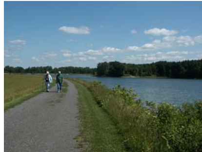
Lake Medina is one of the 12 parks you'll visit while doing the 45th Anniversary Challenge.

The Medina County Park District is celebrating 45 years of enhancing the quality of life for Medina County residents. Since 1965, the park district has worked diligently to acquire and develop land throughout the county for the purpose of open space preservation, protection of unique natural