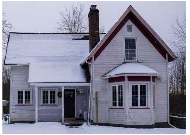
Chippewa Lake Historical Society and Medina County Park District Announce Partnership and Plans for Museum, Parking

Medina County Park District (MCPD) and the Chippewa Lake Historical Society (CLHS) have partnered on a tenyear lease that will bring a museum and new trailhead to Chippewa Lake Park in 2025.