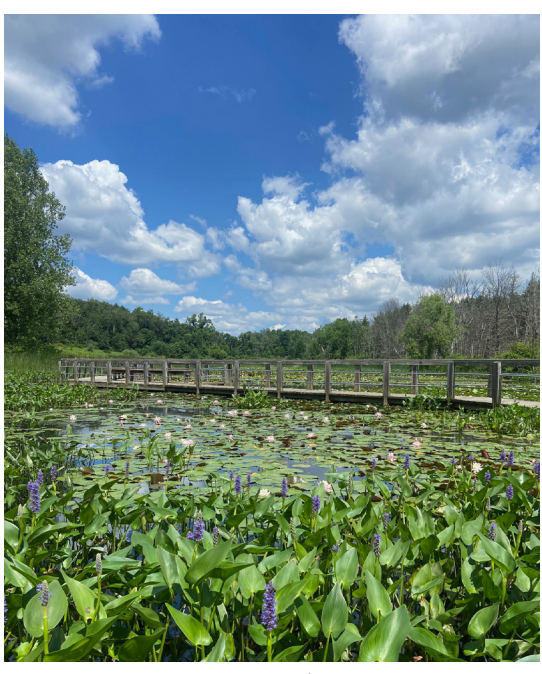
Alderfer-Chatfield Wildlife Sanctuary/Oenslager Nature Center

"This anniversary is not just a celebration of the past 60 years but a commitment to preserving our natural spaces for generations to come."