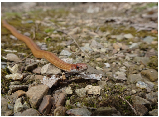
Northern redbelly snake

Imagine walking down a trail on a warm, sunny, fall afternoon. There's a spring to your step, and, perhaps, you're even whistling a tune as you soak up some much-needed Vitamin D. You notice a stick on the trail out of the corner of your eye and continue on your way when suddenly . . . the stick moves! EEK! The spring in your step deflates, the whistling stops, and you do, too, as you jump back to observe the sudden movement. The stick in your path turns out not to be a stick at all but, rather, a snake!