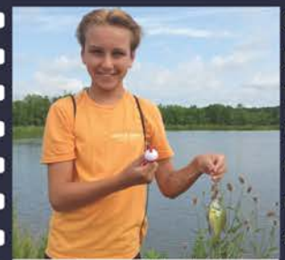
Get Out and Fish Challenge