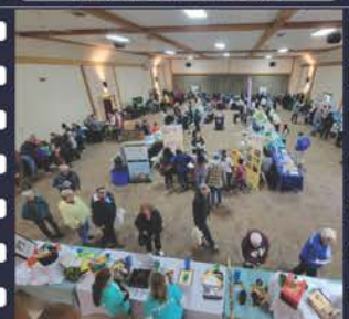
Earth Day Festival