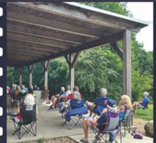
Music at The Lodge