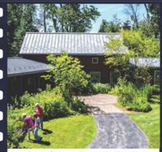
Oenslager Nature Center