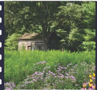
Log cabin at Green Leaf Park