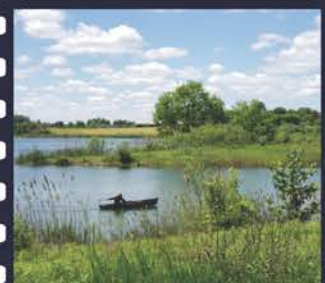
Killbuck Lakes Nature Preserve