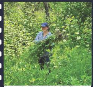
Garlic Mustard Pulls