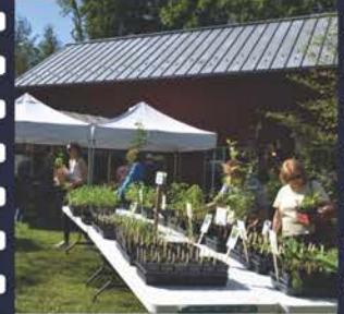
Native Plant Sales