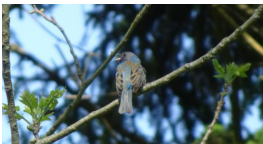
Top Image: A Indigo Bunting is pictured calling from a branch in a tree.