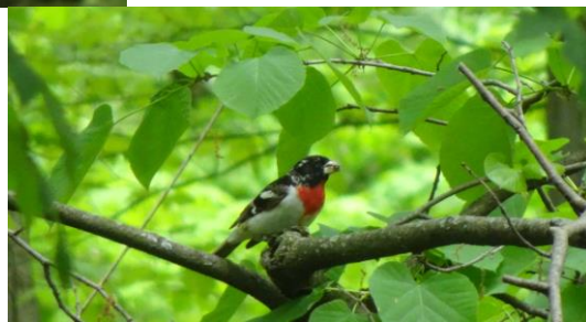
Figure 3: This chart is a comprehensive list of all birds seen during the 2024 Spring Bird Walks at River Styx Park. The list is broken down by species and date, listing individual birds observed.

Spring Bird Walks encourage the experience and enjoyment of spring bird migration for all participants. During walks participants search for both migratory and resident birds. The Rose-breasted Grosbeak and Indigo Bunting are just two examples of birds that may be found during these walks.