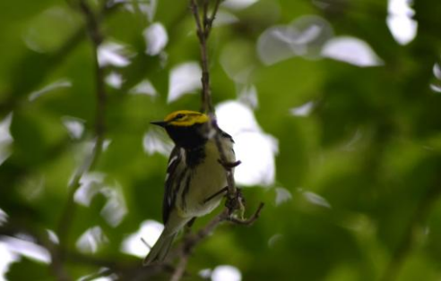
Figure 3: This chart is a comprehensive list of all birds seen during the 2025 Spring Bird Walks at River Styx Park. The list is broken down by species and date, listing individual birds observed.

Spring Bird Walks encourage the experience and enjoyment of spring bird migration for all participants. During walks participants search for both migratory and resident birds. The Yellow Warbler and Black-throated Green Warbler are just two examples of birds that may be found during these walks.