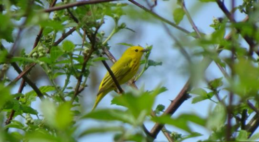
Top Image: A Yellow Warbler is pictured, perched on a branch in moderately dense foliage.